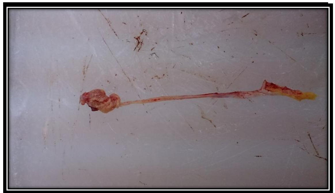
picture (1) showing the parts of the female reproductive system in immature laying hen