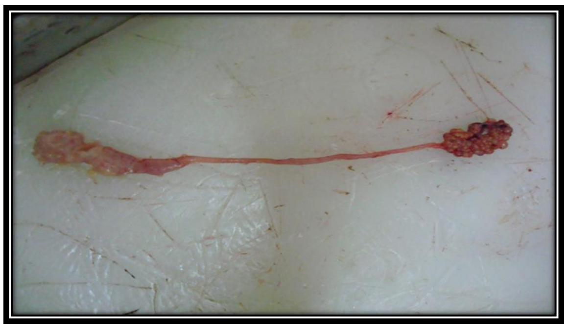
Picture(2) showing the female reproductive system in immature laying duck